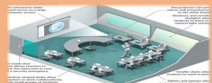
Setting up of Start-up and New Schools